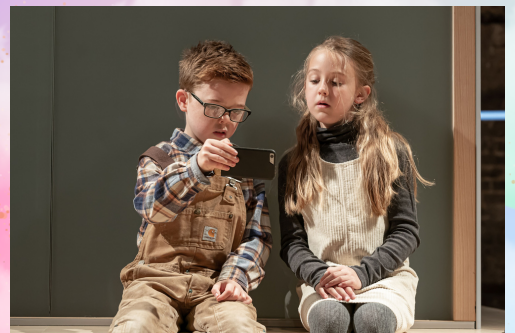
Florence - "THE HUNT"